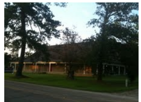
Leslie has adopted removing the weeds. She needs a Weed Team.