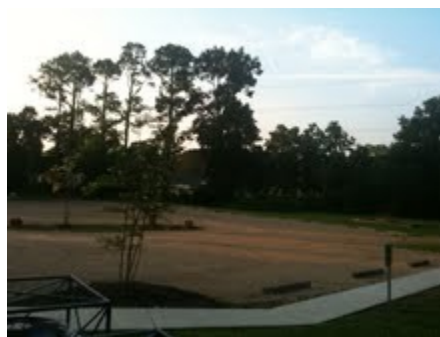
Jimmy is grading the parking lot. Kevin & the Young adults adopted the garden and removing the wood