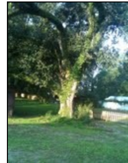
The Savignol family and Judy Walker have adopted removing all dead limbs.

“The land is Yahweh's and it is a gift to us—not in own- ership—but in permission to occupy it and enjoy its fruitfulness.